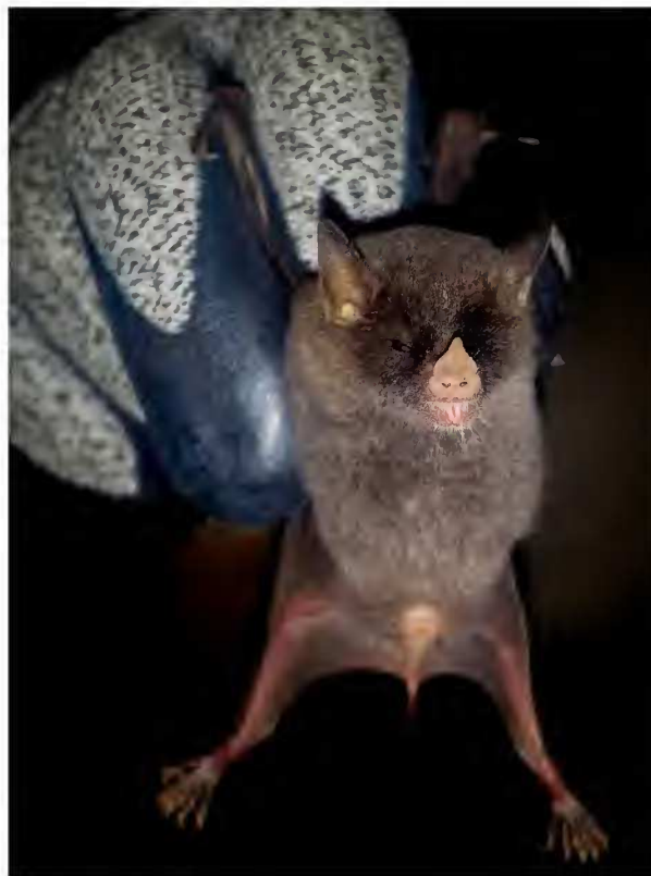
Figure 3. Photograph of a female Monophyllus plethodon , which was the first individual of this species captured on St. Eustatius. This bat was taken at the edge of the crater of The Quill. Note the elongated rostrum, simple nose-leaf, and presences of a tail characteristic of this species.

On this evening the Dutch Team set a 3-m net at a height of 5 m in the middle of the hiking trail from Yellow Rock where it comes near to the edge of the crater of The Quill, and a 7-m net was placed at a right angle to the 3-m net along the rim of the crater. These nets were undoubtedly set near where the American Team